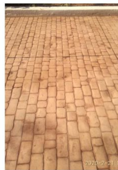
Country Cobble stone