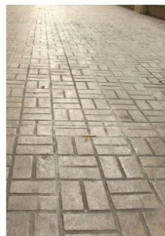
New Bricks wave