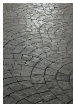
European Fan Pattern