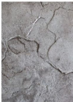
Arizona Sheamless Stone