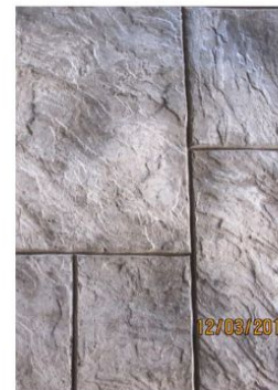
Royal Ashler stone